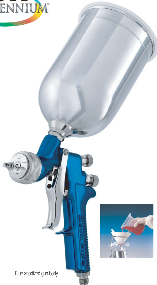
Blue anodized gun body